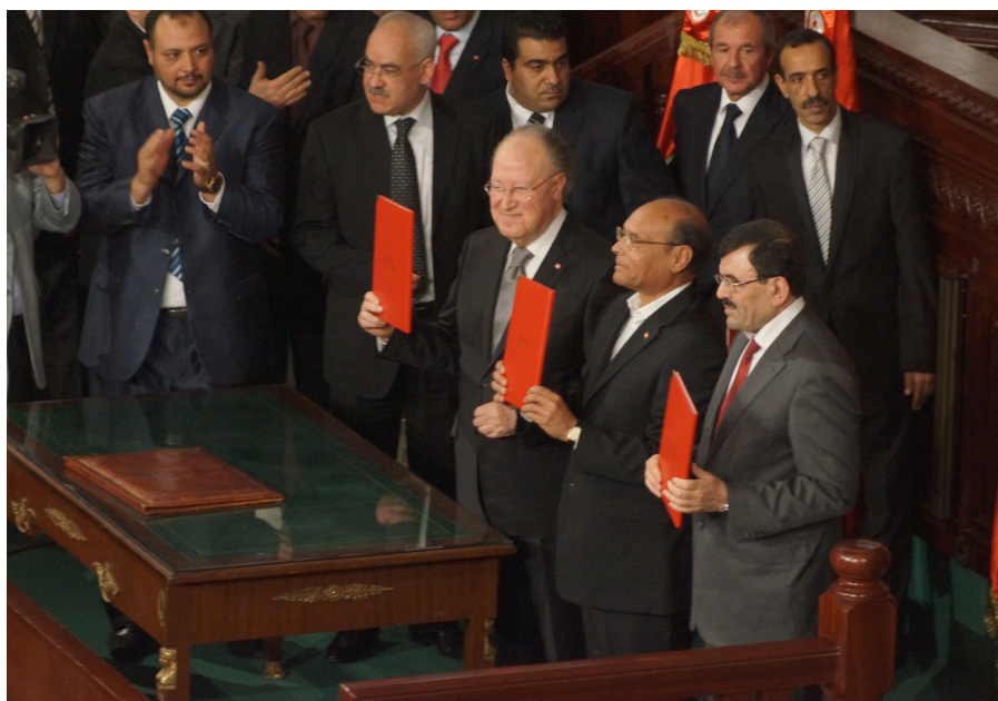
Ikhwān in the Tunisian legislature