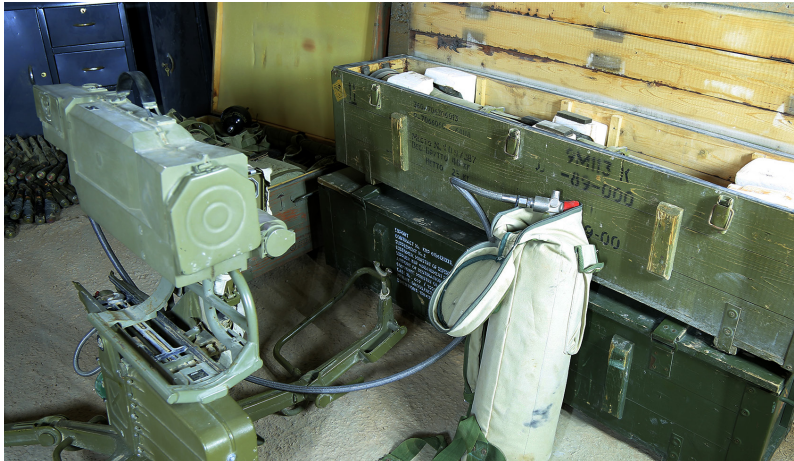
Ghanīmah in Hims