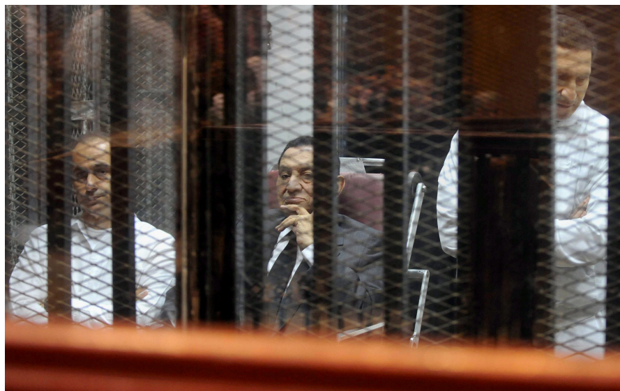
The tāghūt Hosni Mubarak