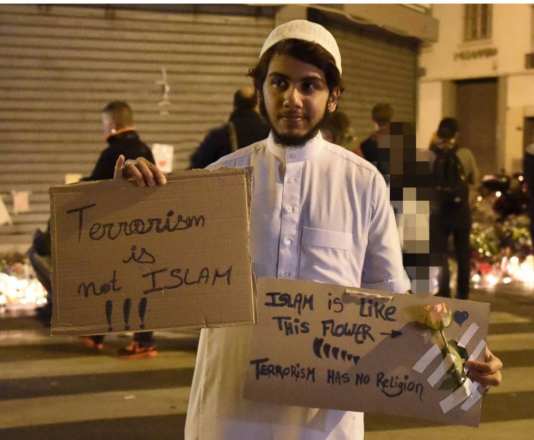
Slogans of apostasy

its protection of "freedom," Hamza Yusuf recently said, "I believe in American exceptionalism," which is basically the concept that the US is a superior nation and should lead the world by its example. It is not surprising then that he was invited to the White House after the September 11th attacks, becoming an advisor to Bush on the war against Muslims, thus becoming a crusader himself. Allah ﷻ said, {O you who believe! Do not take the Jews and the Christians as awliyā'; they are awliyā' to one another. And whoever of you takes them as awliyā', then he is of them} [Al-Mā'idah: 51]. At-Tabarī commented on this āyah, saying, "It means that whoever allies with the Jews and the Christians instead of the believers, then he is one of them. So whoever allies with them and sup-