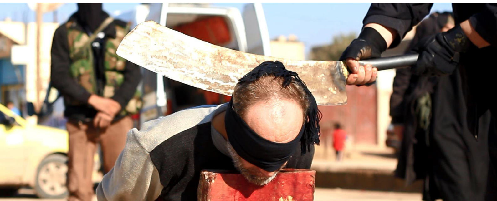
The punishment for apostasy

During the life and mission of the Prophet ﷺ, the issue of riddah arose on a few occasions. The most famous case was that of the 'Uklī-'Uranī apostates. Some men from the tribes of 'Ukl and 'Uraynah came to al-Madīnah, entered upon the Prophet ﷺ, and announced their Islam. They then said to him, "O Prophet of Allah! We are a people of livestock,