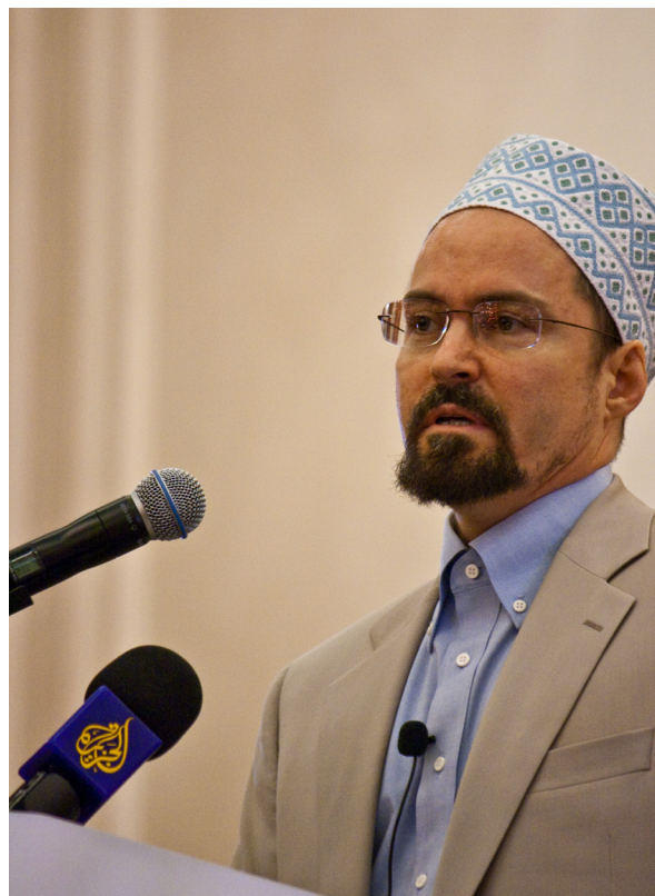
The murtadd Hamza Yusuf

with the world that was to be conquered. Instead, it was the Ākhirah – the life yet lived – that pushed the Muslims to their limits in order to please their Lord, the Creator, the Master of the Universe; for the life of this world, even at the height of its splendor and pleasantries, will always be the believer’s prison.