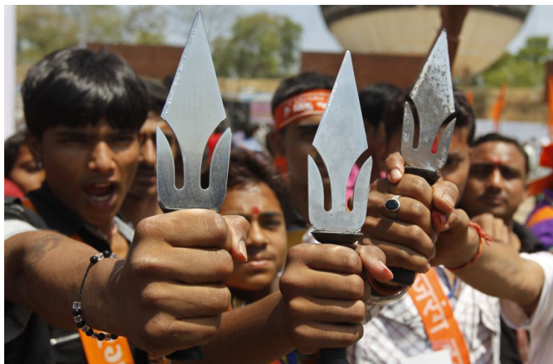
Hindus in Bengal