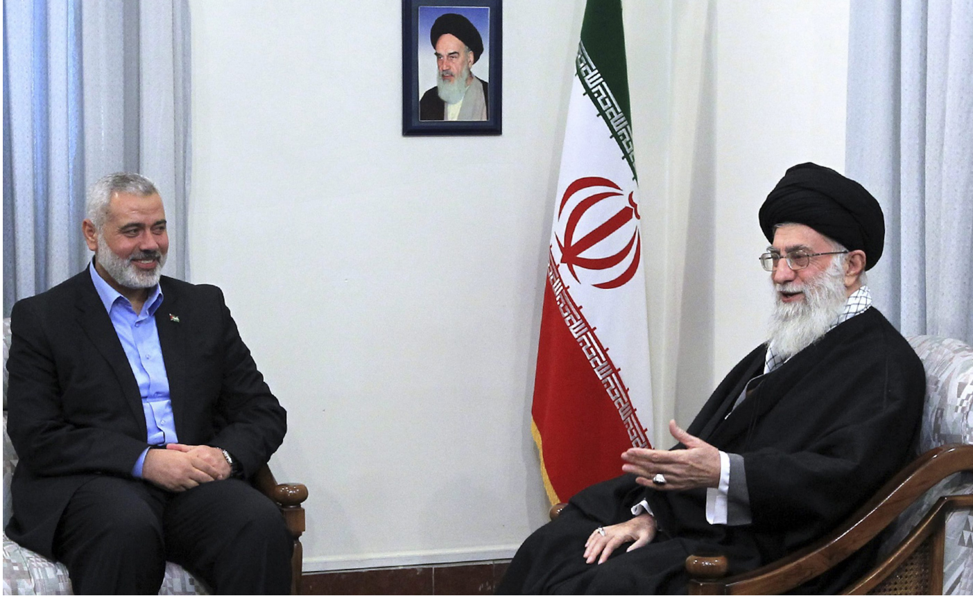
The tāghūt Ismail Haniyeh with the tāghūt Khamenei

became its first “General Guide,” the title given to the leader of the party. Because of the significant role this party played throughout modern history in waging war against Islam and the Muslims, it is important that the muwahhid mujāhid gains insight into its tenets, history, and condition.