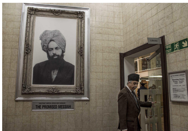
A Qādiyānī temple