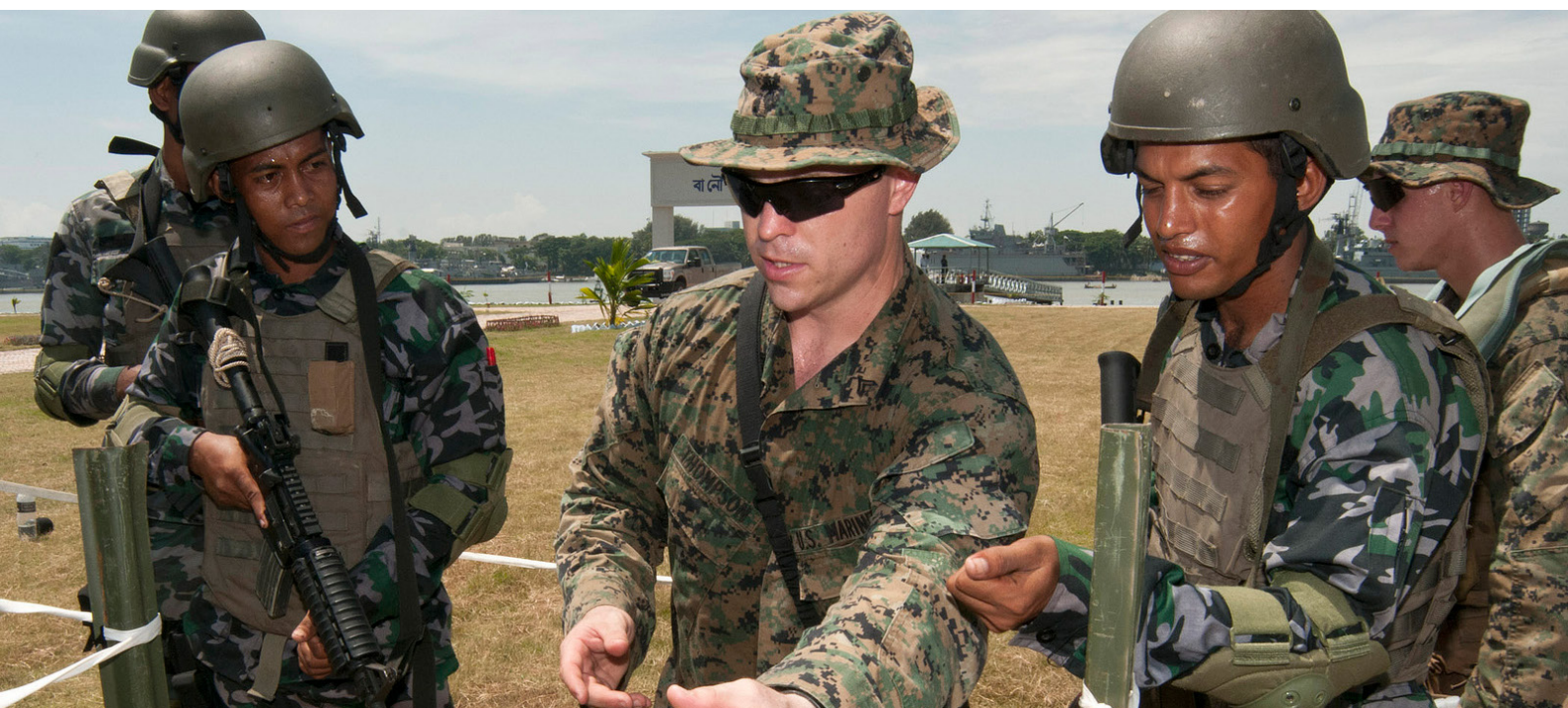
Bengali forces being trained by American crusaders

(DGFI) was founded by the late pro-“Pakistan” tāghūt Ziaur Rahman by borrowing its military strategies and model from the “Pakistani” military and its intelligence (ISI). And while the Bengali army generals were not able to achieve complete dominance over the state affairs like their “Pakistani” counterparts despite many attempts to carry out a military coup, they remained one of the most powerful actors within the nation by maintaining a financially independent existence, as they were not entirely dependent on the civilian government for their funding. Rather, they primarily depend on the UN and its “peacekeeping” missions to provide lucrative salaries for their greedy officers and soldiers. And no matter which of the two civilian governments – whether the pro-“Pakistan” BNP or the pro-Indian Awami League – comes into pow-