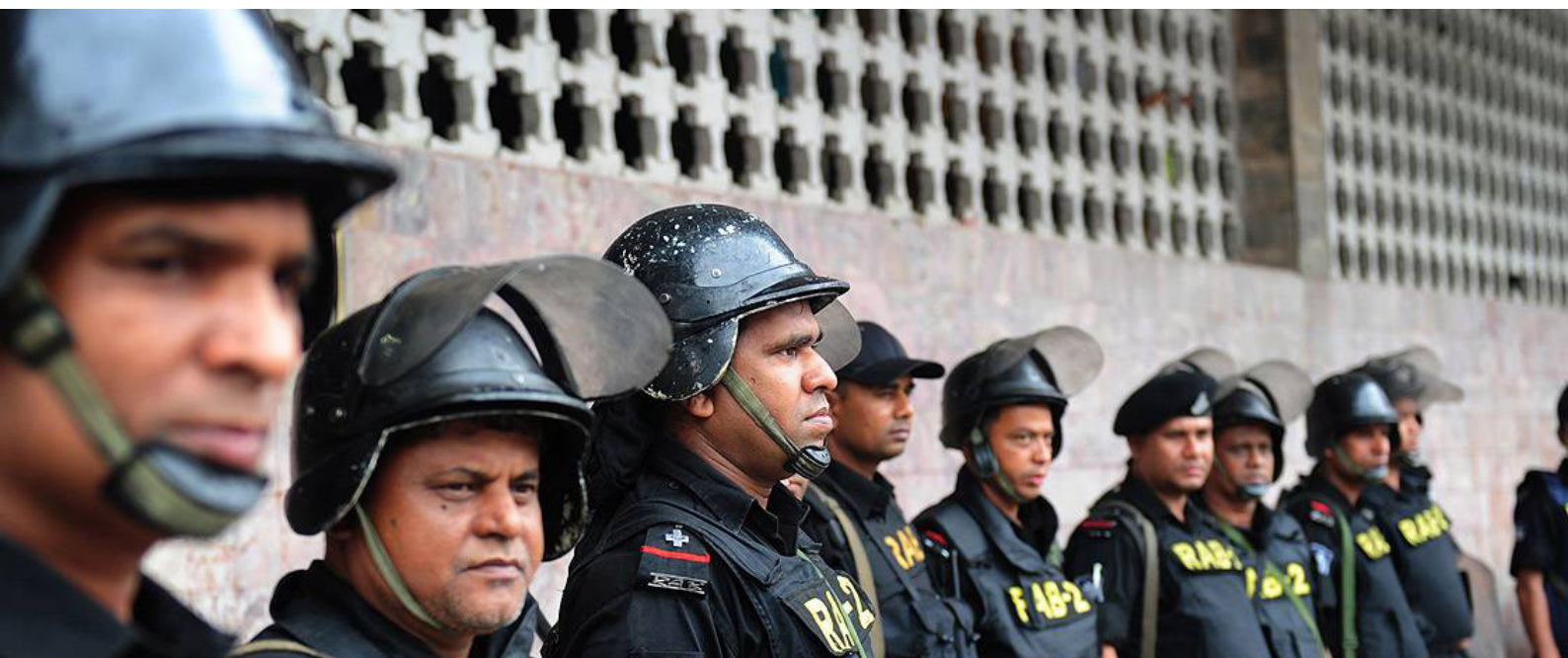
Soldiers of the tawāghīt of Bengal

of the parliament nor fighting them to establish the religion. Also, they keep hidden from the masses the tenets regarding kufr bit-tāghūt, walā' and barā', and jihād, while falsely pretending to be followers of the Salaf. Rather, they simply strive to expose the masses to the teachings of pro-Saudi "scholars" from the Arabian Peninsula and to the teachings of their local mouthpieces, the local "students of knowledge" who have studied under the sorcerers in the universities established and run by the Saudi tawāghīt. Thus, very few people in the region have the true understanding of the religion and the methodology of Ahlus-Sunnah wal-Jamā'ah. This currently represents our biggest challenge in the region, and Allah knows best.