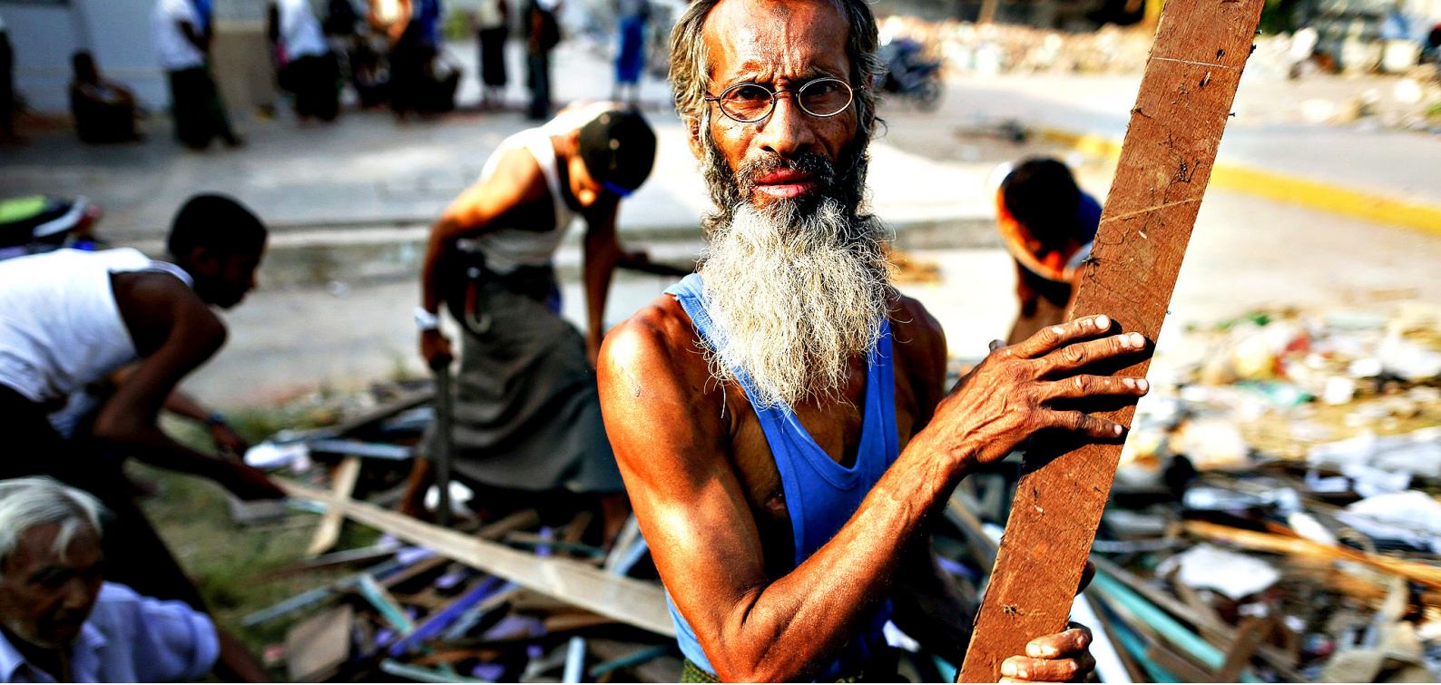
Muslims in Burma suffering under Buddhist oppression

er, they conveniently make a deal with the army generals that there will not be any military coup attempts during the course of their political terms by allowing the army officers to materially benefit from the high salaries flowing into their accounts from the UN missions, which allows them to buy fancy homes and save money for retirement. Thus, this marriage of convenience between the tāghūt civilian government and the murtadd military generals who sell their religion for a miserable price is the primary reason why the Bengali government is the largest contributor to so-called UN “peacekeeping” operations. And Allah knows best.