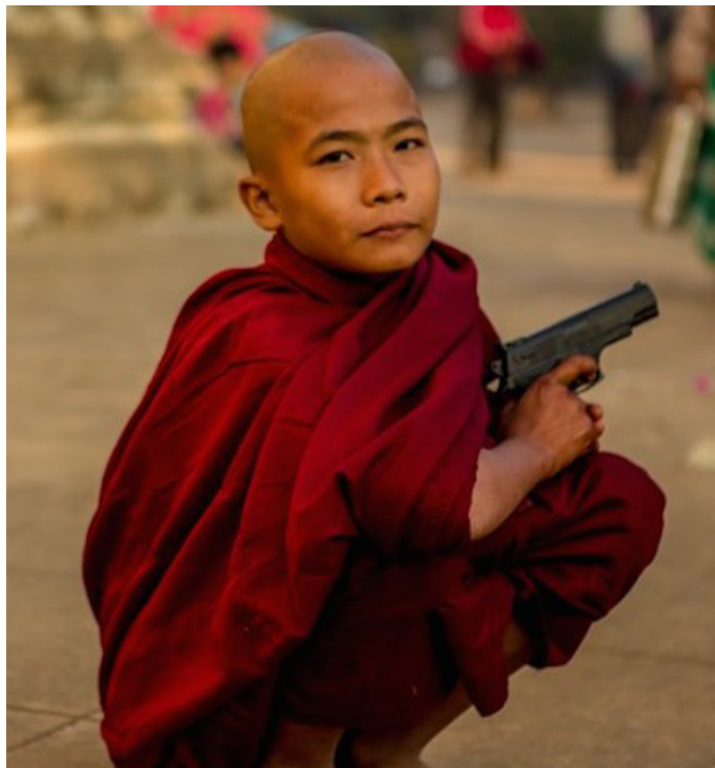
A Burmese Buddhist