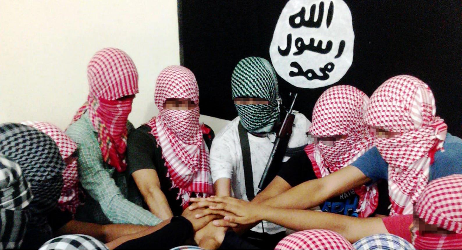
Soldiers of the Khilāfah in Bengal

wealth and your lives, as it is an obligation upon every capable Muslim. There is no way to establish the religion other than the path of qitāl. So leave the Duniyā behind and hasten to join us on the battlefield. And know that we are not calling on you to join us due to our small numbers or our lack of military strength, for indeed we are strong with the help of Allah alone, walhamdulillāh. And we have certainty that we will be victorious by Allah's support, sooner rather than later, inshā'allāh.