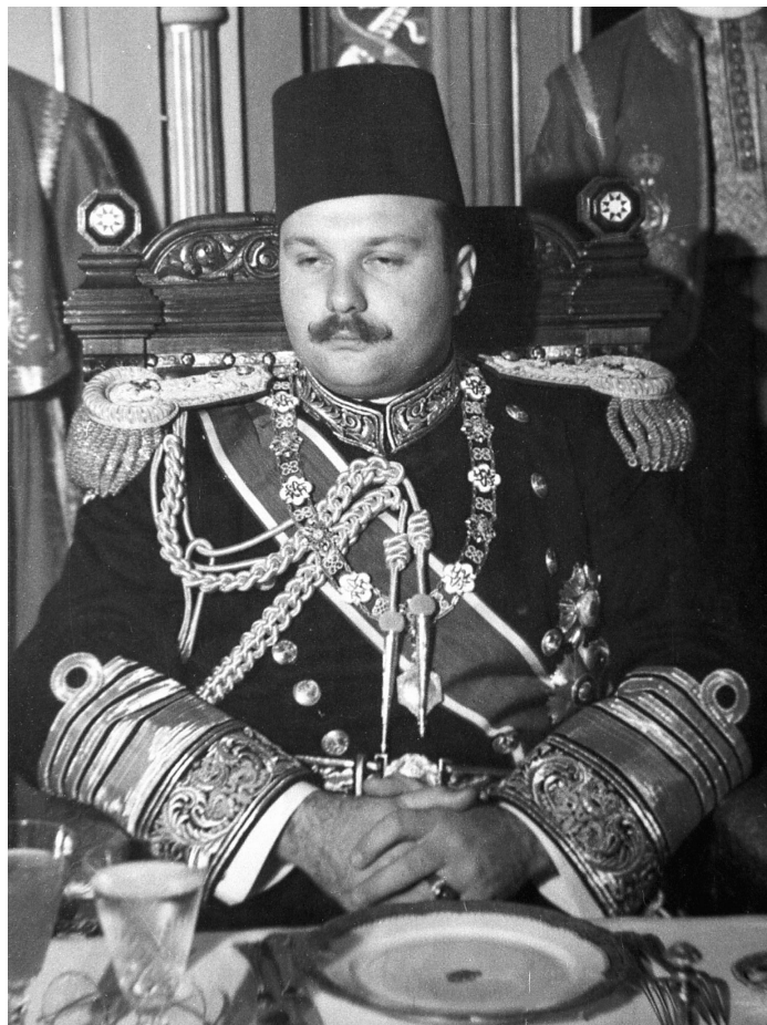
The tāghūt Farouk

Yet, Hasan al-Bannā would enumerate the “merits” of the Egyptian king before the Ikhwān, as al-Bannā explained in his autobiography. He would even order his followers to gather publicly in numbers and greet the king upon any visit of the monarchy to the city, saying, “You must gather on the sidewalks and greet the king, so that the foreigners of the land know that we respect our king and love him, thereby their respect of us will grow” [Mudhakkarāt ad-Da’wah]. The official Ikhwān journal would also call for appointing the king – a non-Qurashī secularist – to the