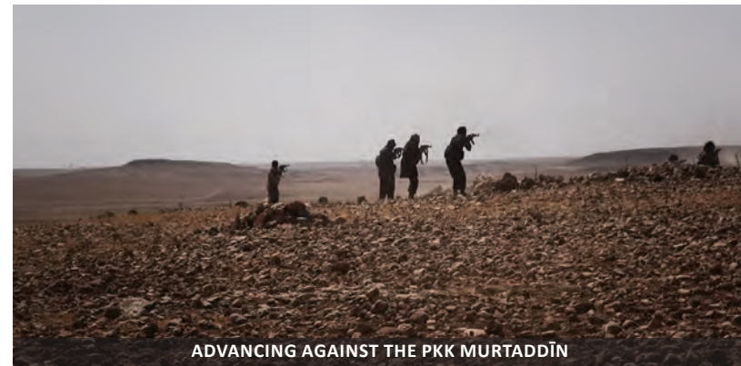
ADVANCING AGAINST THE PKK MURTADDĪN