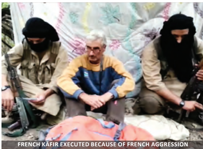
FRENCH KĀFIR EXECUTED BECAUSE OF FRENCH AGGRESSION

hād battleground, and from amongst its leaders. We ask Allah to honor you, bless you, and grant you victory.”