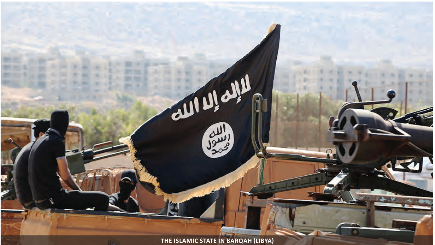
THE ISLAMIC STATE IN BARQAH (LIBYA)

Peninsula, the truth has appeared and prevailed. So come to your State and rally around your Khalīfah. O muwahhidīn in the lands of al-Haramayn, glad tidings, for the jihād that you prepared your saddles for has arrived to the doorsteps of your homes, and no borders will inhibit you from reaching it, nor will any passports or visas prevent you from achieving it.”