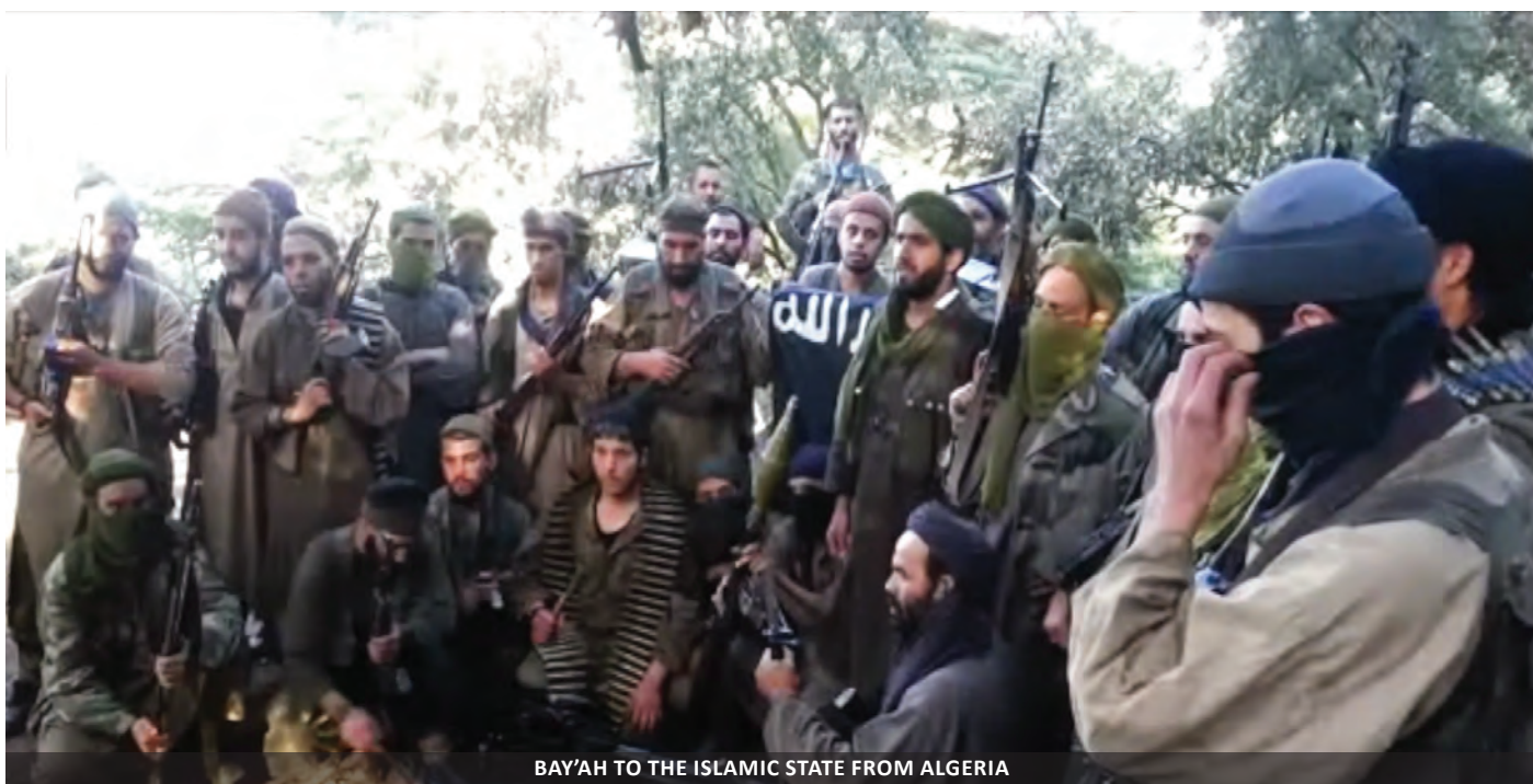
BAY’AH TO THE ISLAMIC STATE FROM ALGERIA

“And indeed the Islamic State will remain. It will remain because it was built upon the corpses of martyrs and it quenched its thirst with their blood, and by such the market for Jannah was convened. It will remain because the success granted by Allah in this jihād is more obvious than the sun in the center of the sky. It will remain because it did not become contaminated by a prohibited income or distorted methodology. It will remain by the truthfulness of the leaders who sacrificed their blood and the truthful-