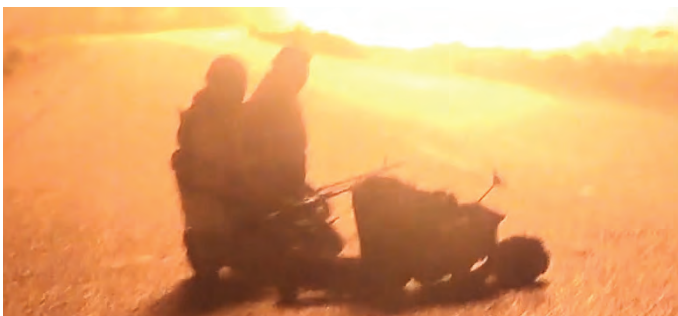
SUJŪD ASH-SHUKR AFTER THE SUCCESSFUL EXPLOSION

He (sallallāhu ‘alayhi wa sallam) also said, “Glad tidings to Shām, glad tidings to Shām, glad tidings to Shām.” The Sahābah asked, “Why is that?” He responded, “Allah’s angels have spread their wings over Shām” [Sahīh: Reported by at-Tirmidhī on the authority of Zayd Ibn Thābit al-Ansārī].