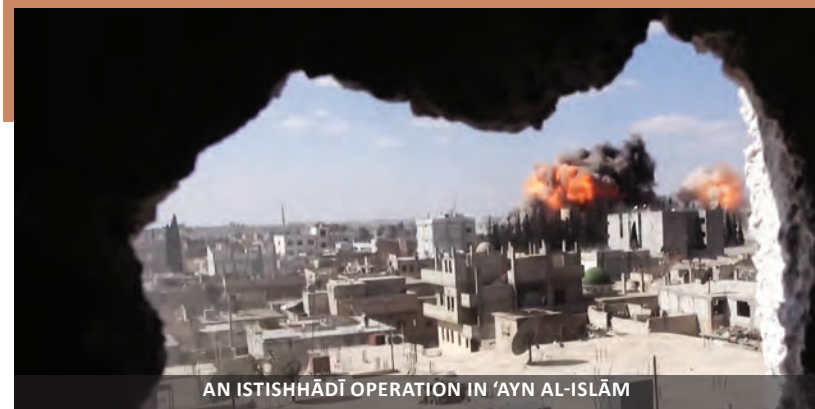
AN ISTISHHĀDĪ OPERATION IN 'AYN AL-ISLĀM

Soon afterwards, the media was abuzz with the news that the Peshmerga and FSA murtaddīn would be sending reinforcements. This further highlighted the PKK's impotence in fighting the Islamic State. They were supported by a coalition that armed them, supplied them, reinforced them, and even provided