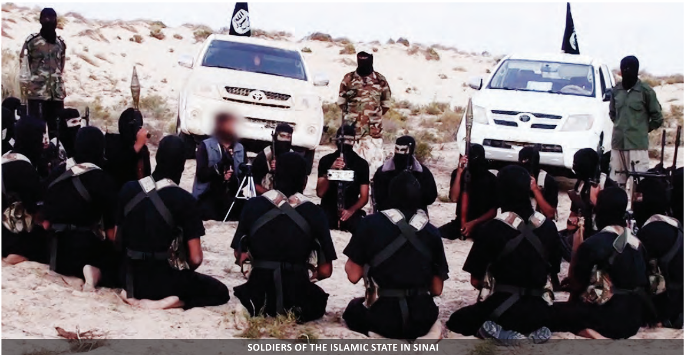
SOLDIERS OF THE ISLAMIC STATE IN SINAI

for Yemen, then O alas for what has come upon Yemen. Alas! Alas for Sanaa. The Rafidī Houthis have entered it, but the car bombs have not roasted their skin, nor have the explosive belts and IEDs severed their joints. Is there not in Yemen a person who will take revenge for us from the Houthis? {And if you turn away, He will replace you with another people; then they will not be the likes of you} [Muhammad: 38]” [Indeed Your Lord Is Ever Watchful].