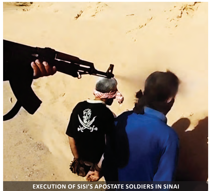
EXECUTION OF SISI’S APOSTATE SOLDIERS IN SINAI

burden anyone with what is beyond their scope. Allah says, {And He has not placed upon you in the religion any difficulty} [Al-Hajj: 78].”