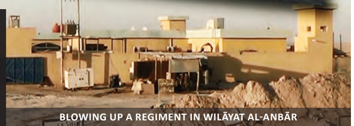
BLOWING UP A REGIMENT IN WILĀYAT AL-ANBĀR

As the focus of the international media lay squarely on ‘Ayn al-Islām, ignoring the massacres carried out by the Safawī army and militias and their American backers against the Sunni population in Iraq, the mujāhidīn were at work seeing through the Islamic State’s strategy for the liberation of Wilāyat Al-Anbār.