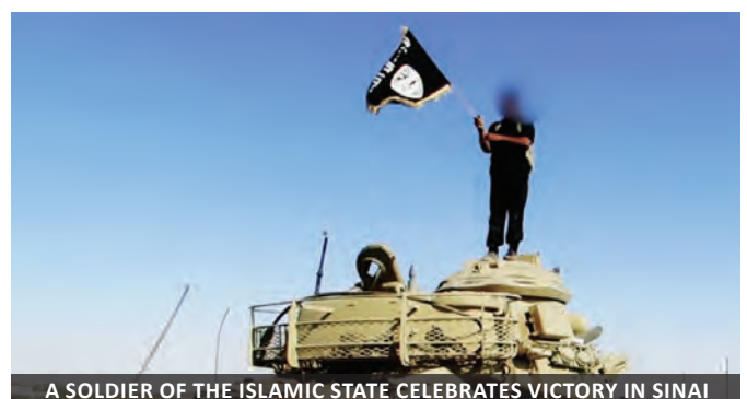
A SOLDIER OF THE ISLAMIC STATE CELEBRATES VICTORY IN SINAI

Prior to the announcement of the new wilāyāt, a number of groups in Khurāsān, al-Qawqāz, Indonesia, Nigeria, the Philippines, and elsewhere had pledged their allegiance to the Khalīfah, and continue to do so daily. The Islamic State announced the acceptance of the bay’āt from all of these groups and individuals – may Allah accept their noble oath and keep them firm upon their covenant, free of falter – but delayed the announcement of their respective wilāyāt, while recognizing that some groups from the aforementioned lands are larger and stronger than a few of those related to the newly announced wilāyāt. This delay should end with either the appointment or recognition of leadership by the Khalīfah for those lands where multiple groups have given bay’āt and merged, or the establishment of a direct line of communication between the Khilāfah and the mujāhid leadership of lands who have yet to contact the Islamic State and thus receive information and directives from the Khalīfah. May Allah bring glad tidings from these lands and others soon and fill the believers’ hearts with further joy.