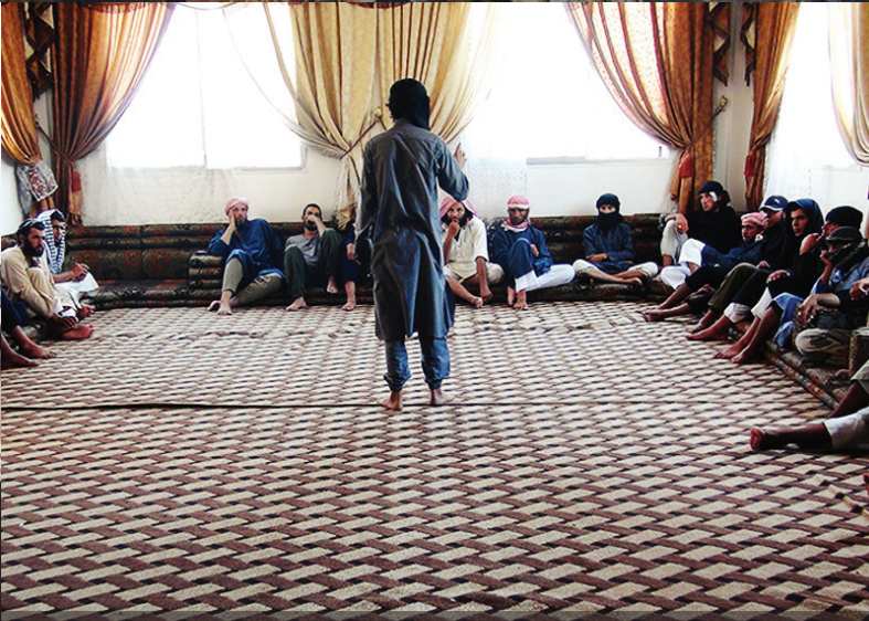
GROUP REPENTANCE OF SAHWAH FIGHTERS IN AL-KHAYR