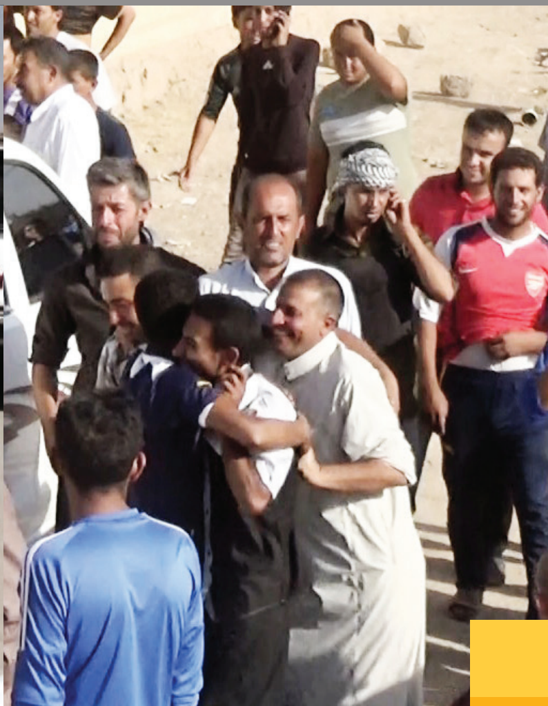
THE MUSLIMS REJOICE IN THE VICTORY AND WELCOME THE MUJĀHIDĪN