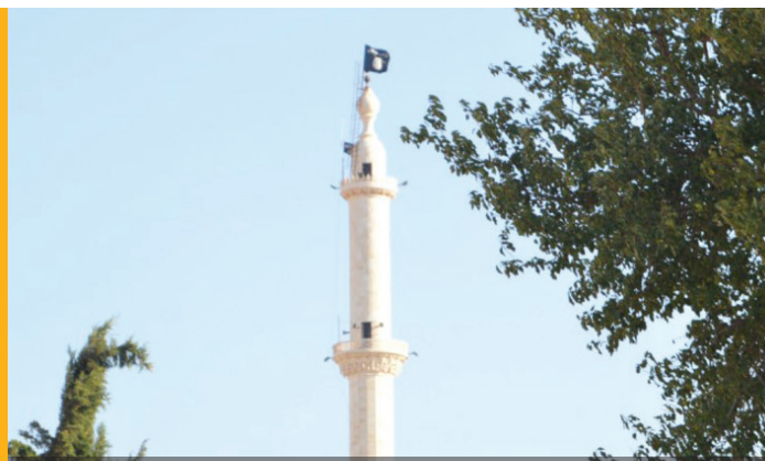
THE FLAG OF TAWHĪD FLUTTERS OVER AKHTARĪN

We ask Allah to place us in the camp of the believers on the day of al-Malhamah and keep us firm until he grants us either victory or shahādah.