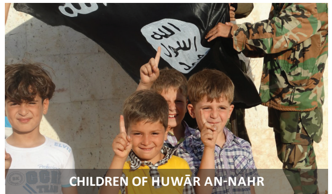
CHILDREN OF HUWĀR AN-NAHR

This month, the soldiers of the Islamic State launched a swift and brutal offensive in the northern Halab countryside. The campaign, entitled “Taking Revenge for the Chaste Sisters,” targeted the treacherous sahwāt murtaddīn who prostituted themselves to America and its regional puppets, stabbing the mujāhidīn in the back and subsequently imprisoning and even raping many of the muhājirāt.