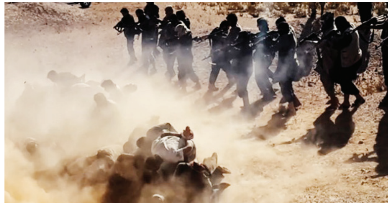
EXECUTION OF SHU'AYTĀT TRAITORS

Upon hearing these statements of the Shaykh back in 1426H (2005), many Muslims who were sitting at home, living in "modernized" societies, never experiencing war nor tribalism, naively said to themselves, "He is declaring war on whole tribes! How can that be done? What do individual members of the tribe have to do with the actions of specific tribe members or even the decisions of tribal elders?!"