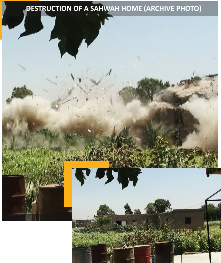
DESTRUCTION OF A SAHWAH HOME (ARCHIVE PHOTO)