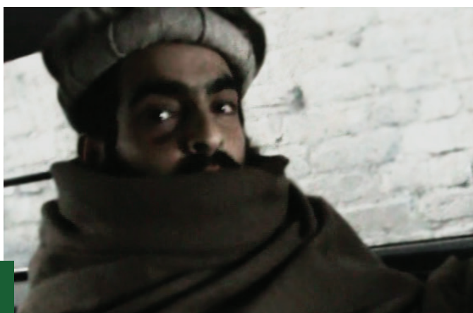
MAY ALLAH ACCEPT HIM

This condition described is probably one many Muslims experience daily. There is no solution for it except by taking the first step towards jihād – hijrah.