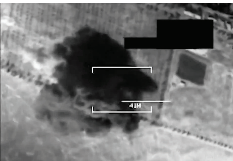
AMERICAN AIRSTRIKE AGAINST THE ISLAMIC STATE

5) The US attempted a rescue mission in Wilāyat ar-Raqqaḥ, which failed when some of the members of the mission were injured and possibly killed, so they carried their fallen away with disaster.